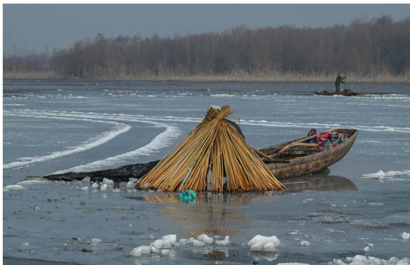
Braving the cold: A fisherman huddles under a makeshift shelter on his boat to catch fish in the frozen Anchar Lake.

Those apprehended have been involved in the | More on P6