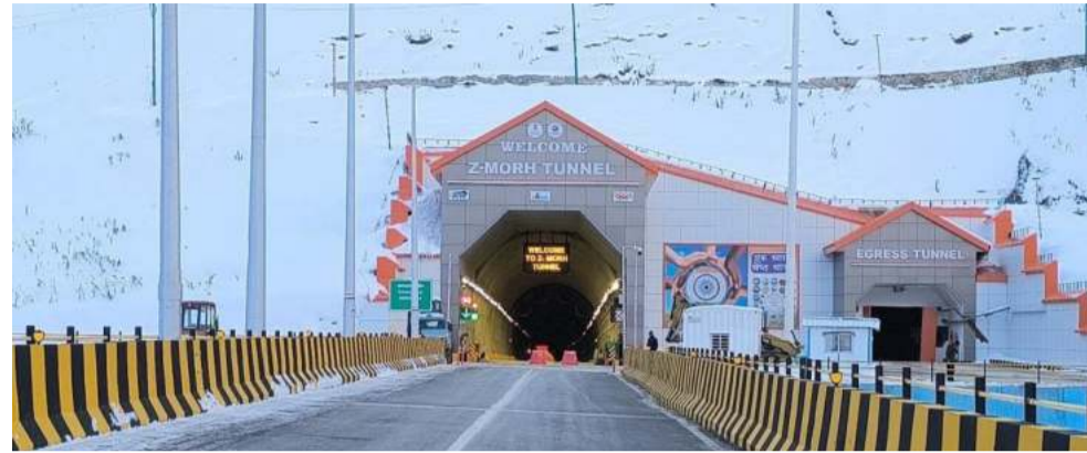
Press Trust Of India

GANDERBAL: Residents of Ganderbal district, living on either side of the 6.5 kilometre Z-Morh tunnel on Srinagar-Sonamarg highway, are hopeful that the mega-infrastructure project will boost the local economy and help eradicate unemployment in the area.