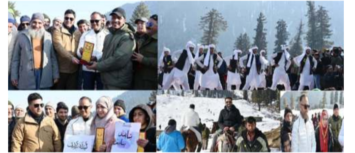
Observer News Service

SHOPIAN: The two-day Heemal Nagrai Winter Carnival at Dubjan Shopian wrapped up on Sunday, drawing enthusiastic crowds of locals and tourists who attended in unprecedented numbers.