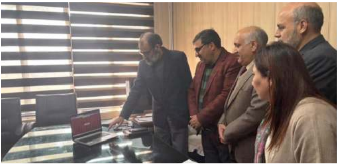
Observer News Service