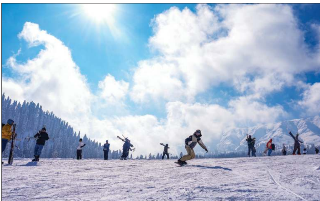
Skiers glide down the snowy slopes of Gulmarg enjoying the winter sports season.