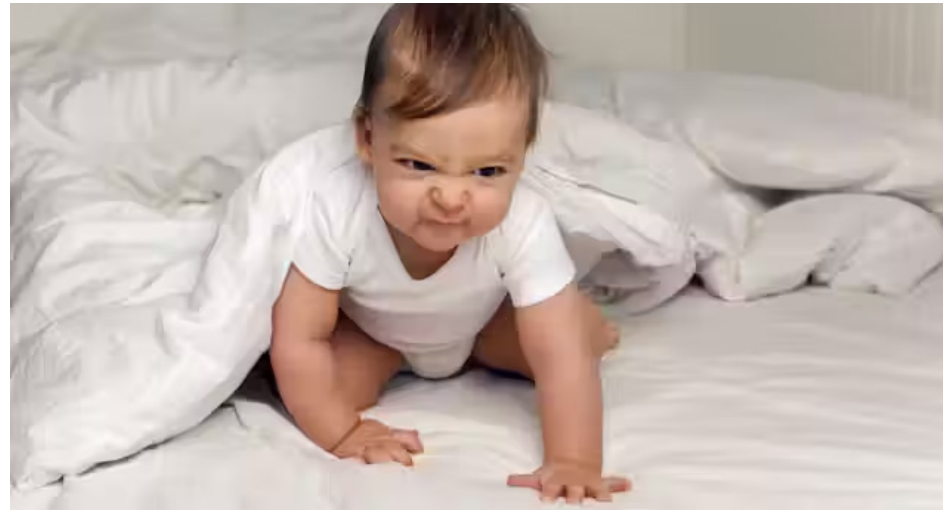
With a final sample of 567 babies, tested in 37 research labs across five continents, babies did not show evidence of an early-emerging moral sense. Across the ages tested, babies showed no preference for the

This is the chief aim of ManyBabies, a consortium of developmental psychologists spread around the world. By combining resources across individual research labs, ManyBabies can robustly test findings in developmental science, like Hamlin’s original “helper-hinderer” effect. And as of last month, the results are in.