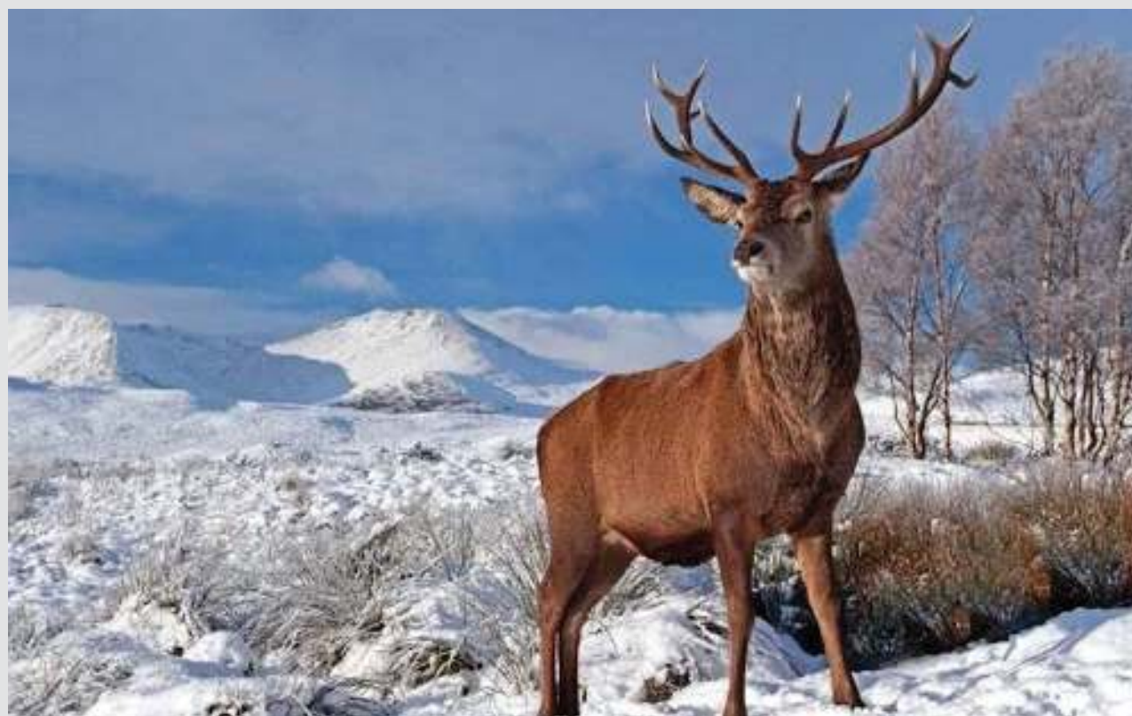
Kashmir Hangul at Dachigam Wildlife Reserve

One more factor that contributes to animal stress is pollution, including noise, light, chemical pollutants, and plastic waste etc, has become one of the leading causes of stress in wildlife. Noise pollution from traffic, aircraft, or construction, mining etc can disrupt communication, breeding, and feeding behaviors and mating behaviors in animals. Toxic pollutants in the water, air, and soil can also cause physical harm, altering reproductive success and survival rates and affect the overall health of wild animals. Due to scarcity or shortage of food and water or during periods of drought lead to stress due to competition for food with other individuals or species. Additionally human activities such as deforestation, urbanization, or agricultural expansion lead to habitat fragmen-