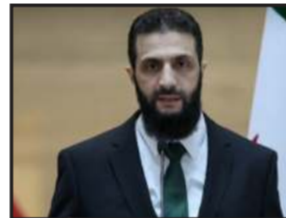
Ahmed Al Sharaa who was known by his nom de guerre, Abu Mohammed al-Jolani now is the West recognised defacto head of Syria

Asked why Syria has yet to send a direct message to the Gulf and major Arab nations,