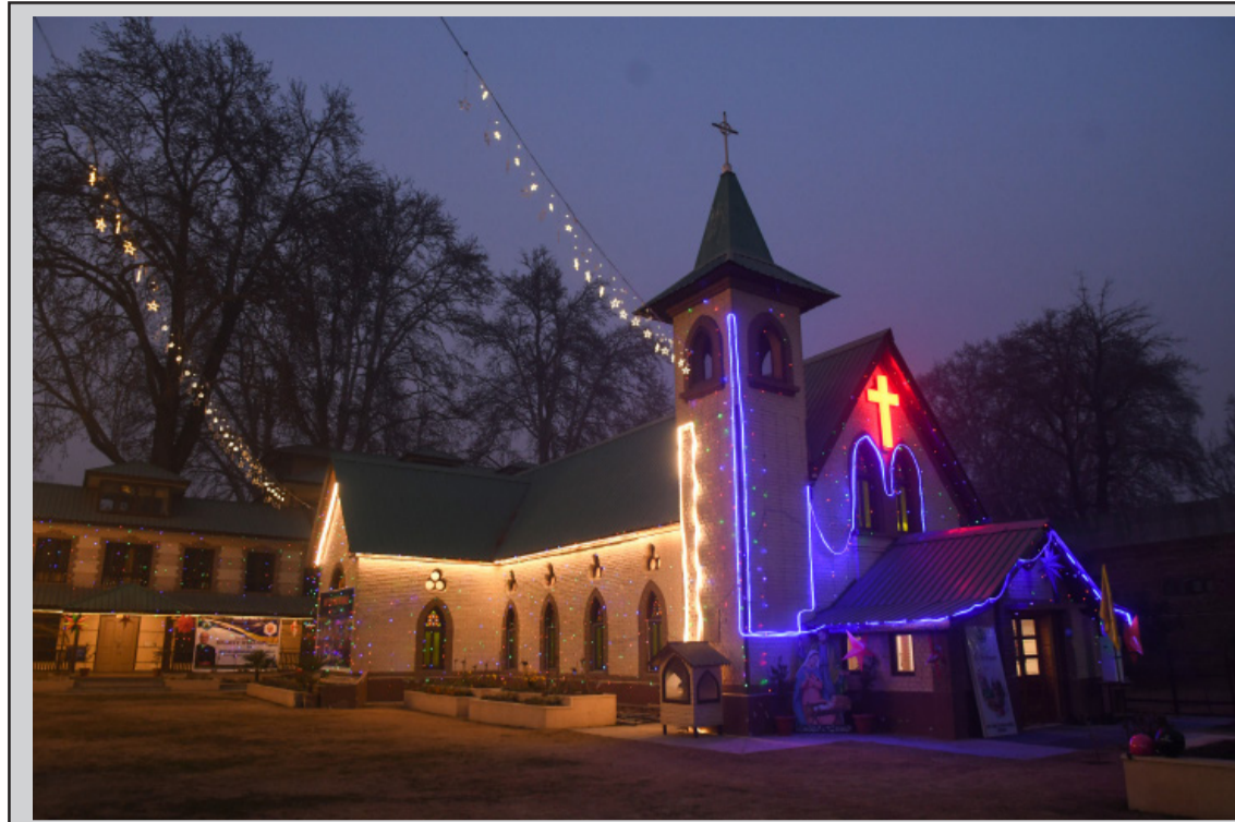
HOLY FAMILY CATHOLIC CHURCH on Maulana Azad Road, Srinagar, shines brightly with festive decorations, spreading joy and warmth on the eve of Christmas!

Other churches in the valley are also expected to attract large gatherings. Celebrations are set to begin on Tuesday night in many locations, with special prayer services scheduled for early Wednesday morning, followed by cultural programs and community gatherings at various churches across the valley—(KNO)