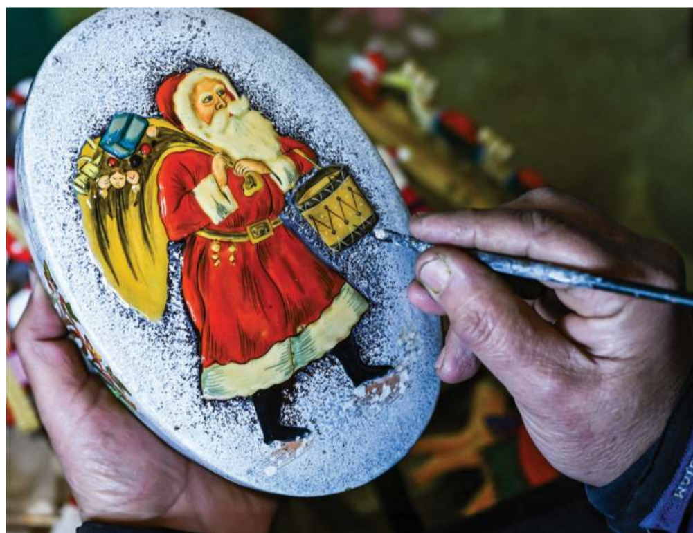
A paper mâché artist carefully paints the figure of Santa Claus.

"May this Christmas fill the hearts of people | More on P10