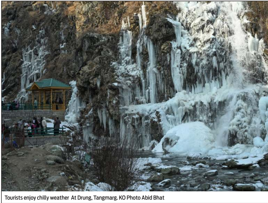
Tourists enjoy chilly weather At Drung, Tangmarg

"We have raised this issue with the concerned authorities several times, but no action has been taken so far," said a group of residents.