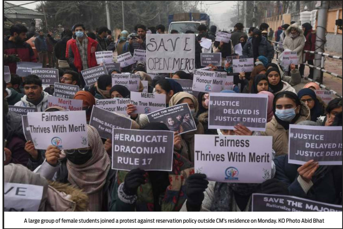
A large group of female students joined a protest against reservation policy outside CM's residence on Monday

sustainability, environmental conservation, and community-centric planning as key components for shaping the city's future. "This visit underscores the importance of inter-city collaboration in pursuing urban excellence," said an official from Srinagar Smart City Ltd. "We are delighted to share our experiences and learn from AMC's perspectives, paving the way for smarter and greener cities." The AMC officials praised Srinagar's innovative and sustainable urban planning, commending the city for effectively blending modernization with the preservation of its rich heritage.