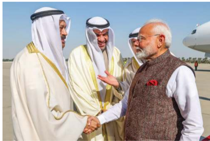
Press Trust Of India

Kuwait: Prime Minister Narendra Modi on Saturday arrived here in the Gulf nation on a two-day visit where he will meet the Indian diaspora and hold talks with Kuwaiti leadership to "strengthen the India-Kuwait friendship across