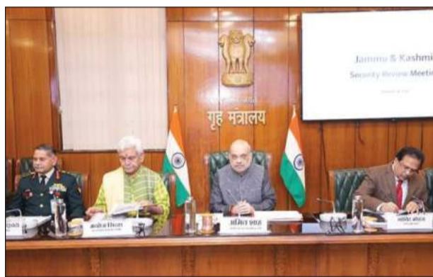
(MHA) attended the meeting. This was Shah's first meeting to review the security situation in the Union territory

J&K Lieutenant Governor Manoj Sinha and top officers of the Army, paramilitary forces, J&K administration, intelligence agencies and the Ministry of Home Affairs