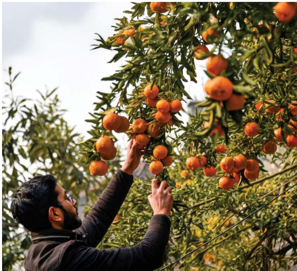
A young boy picks ripe oranges in an orchard in Srinagar.