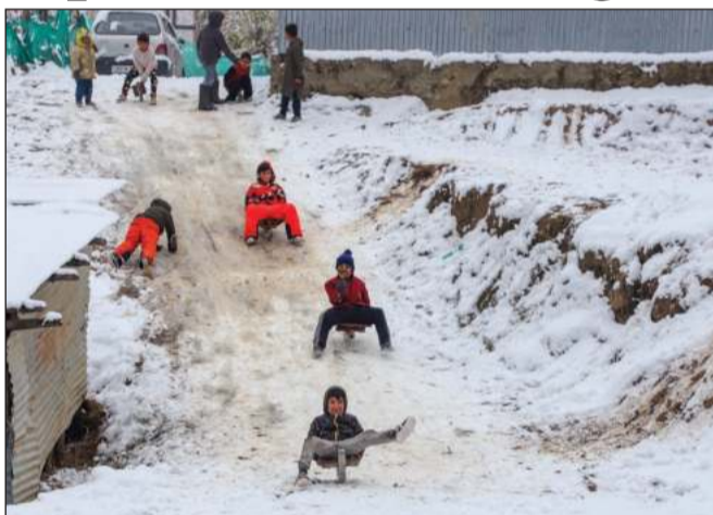
Children enjoy sledding in Tangmarg, Baramulla, as Kashmir plains receive season's first snowfall.