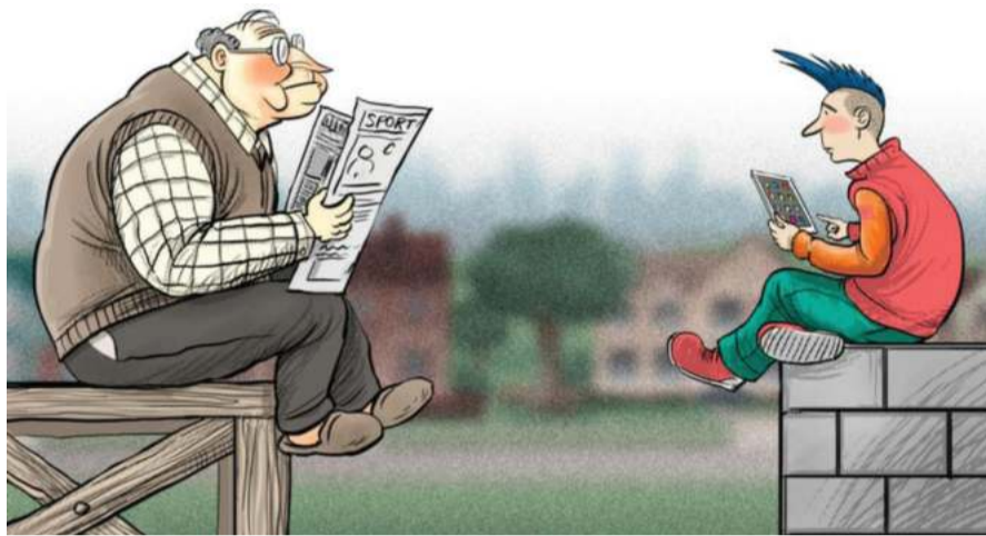
The Mirror Shatters: How Digital Realities Distort Family Bonds

The wisdom that older generations possess is a valuable resource, shaped over years of experience and trials. However, in today's fast-paced world, that wisdom can seem out of place. Children and younger adults, influenced by the flashy success stories on social media or the rapid pace of technological advancement, may find patience and slow, deliberate decision-making outdated. The psychological disconnect here is not just a matter of differing opinions, but a clash of worldviews—one shaped by decades of real-world struggle and the other by the allure of quick rewards and instant success. Younger generations, accustomed to a world of immediate feedback and constant dopamine hits from social media likes and viral content, often perceive the older generation's wisdom as a hindrance rather than a guiding light. In the brain's reward system, the immediate rewards associated with social media engagement stimulate the release of dopamine, reinforcing impulsive behavior. In contrast, the delayed gratification that older generations experienced activates different neural pathways associated with patience, control, and long-term planning, often leading to frustration when the two approaches meet.