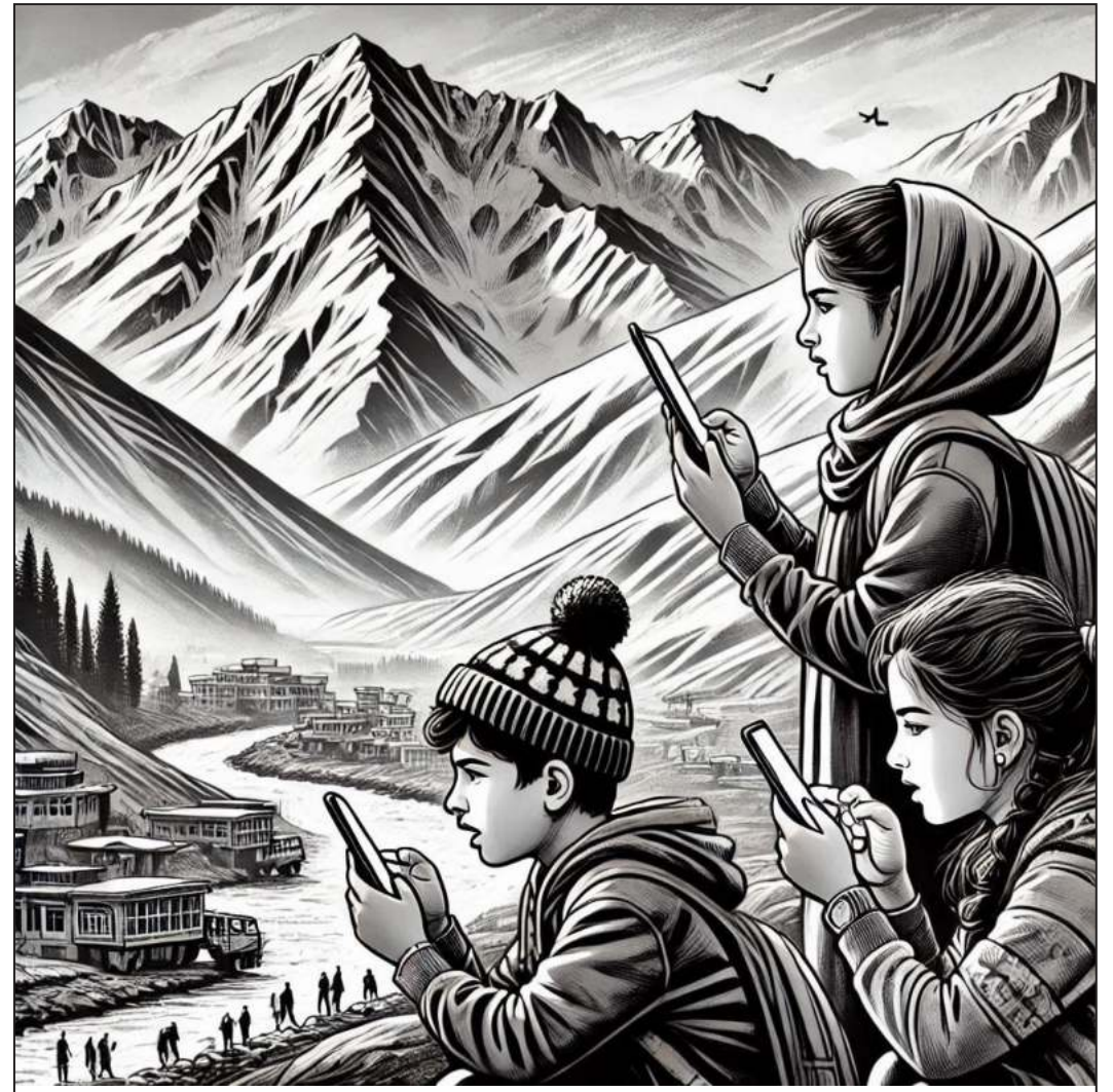
This image is AI generated

Culturally, the overuse of digital devices has led to a disconnection from Kashmir's rich heritage. Traditional activities such as storytelling, music, and outdoor games are gradually being replaced by virtual engagements. This shift is particularly concerning for the younger generation, who are losing touch with their cultural roots. For instance, fewer children are learning Kashmiri folk songs or participating in tradi-