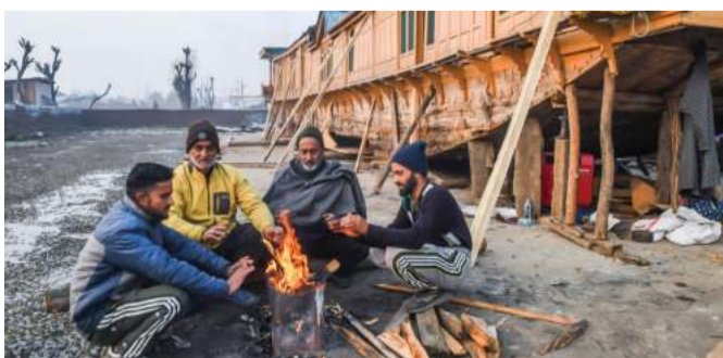
minus 2.1 degrees Celsius on November 28 as well. Qazigund – the gateway town to the Valley in | More on P6

Srinagar: Cold conditions intensified in Kashmir on Thursday as the minimum temperature settled below the freezing point across the Valley, with a few places experiencing the season's coldest night, officials said. The minimum temperature in Srinagar dropped to a season's low of minus 2.1 degrees Celsius on Thursday, compared to the previous night's minus 2 degrees Celsius, officials said. The city registered a low of