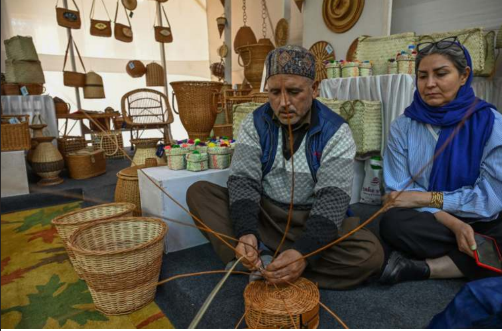
A Kashmiri artisan skillfully weaves a wicker basket as an Iranian artisan observes keenly at SKICC. showcasing a blend of traditional craftsmanship and cultural exchange.

The minister also praised the state of education in government schools, saying that both teaching facilities and faculty are of a high stan-"Government school students have been excelling in various fields, and the education department will work to encourage parents to admit their children to government schools for a bright future,' she said—(KNO)