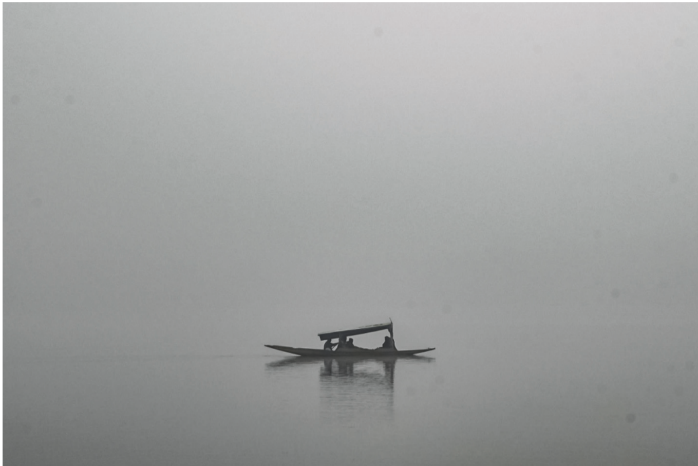
A shikara glides through Dal Lake on a foggy morning in Kashmir.