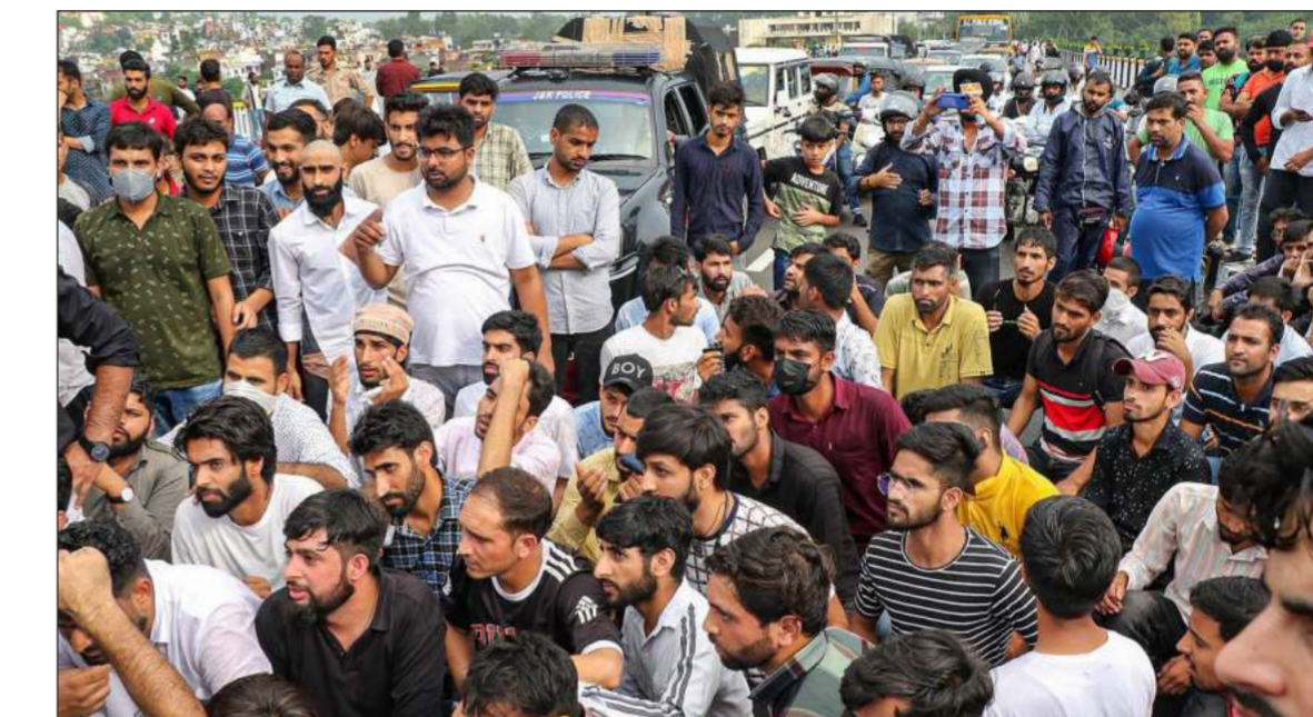
Picture credits: Gujjar and Bakerwal students protest against the introduction of the Bill granting reservation to Pahari people in Scheduled Tribe (ST) category in Jammu and Kashmir, in Jammu on July 28, 2023. File

However, reservations must be implemented thoughtfully, accompanied by measures such as skill development, digital accessibility,