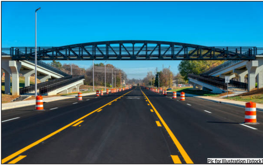
Pic for illustration

Meanwhile, investigations have been initiated—(KNO)