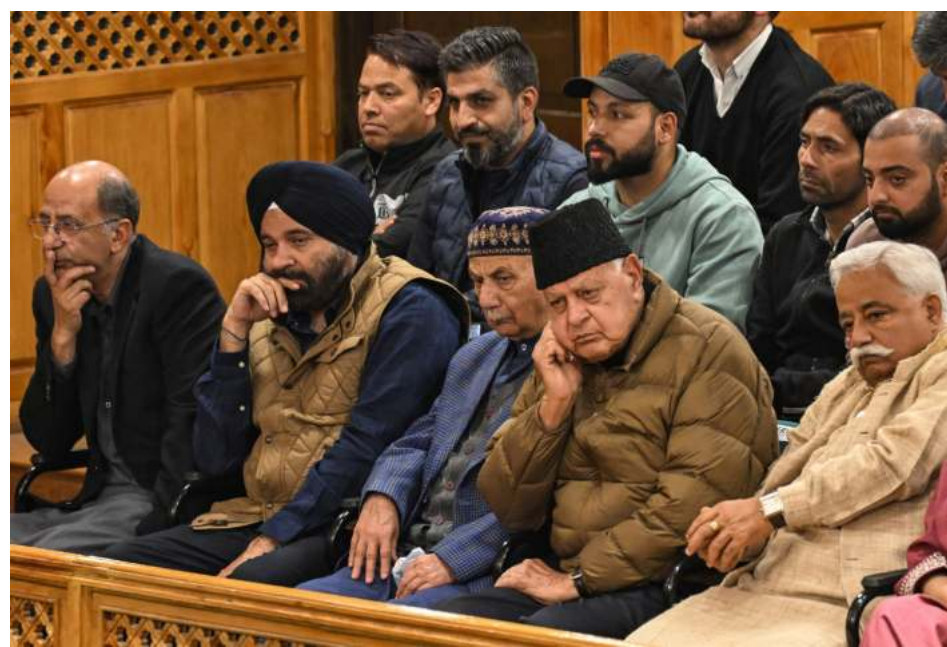
NATIONAL CONFERENCE PRESIDENT FAROOQ ABDULLAH along with other party leaders on Friday observed the Jammu and Kashmir Assembly proceedings from the Speaker's gallery on the last day of the first session.

Accuses Speaker Of Acting As NC's Agent, Says Party Diverts Focus From Governance To Hollow Slogans