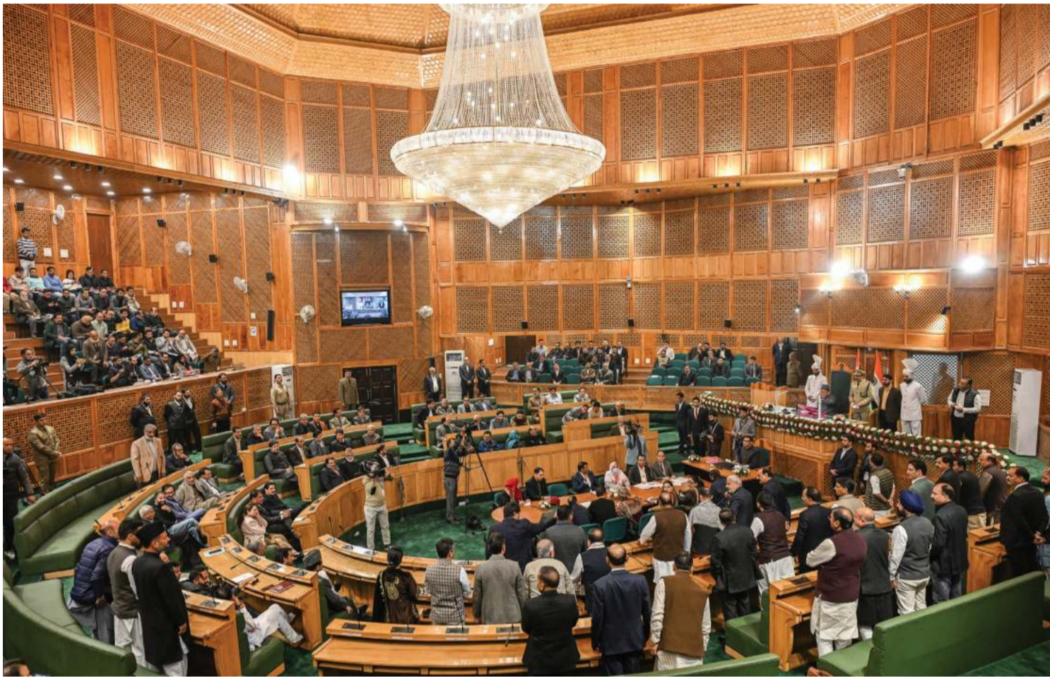
The first session of the Jammu and Kashmir Assembly kicked off on Monday.