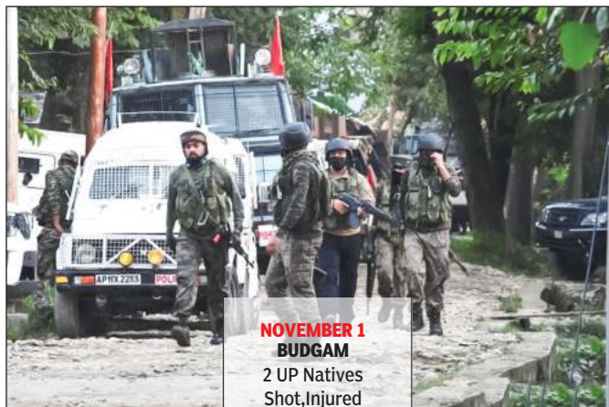
NOVEMBER 1 BUDGAM 2 UP Natives Shot, Injured