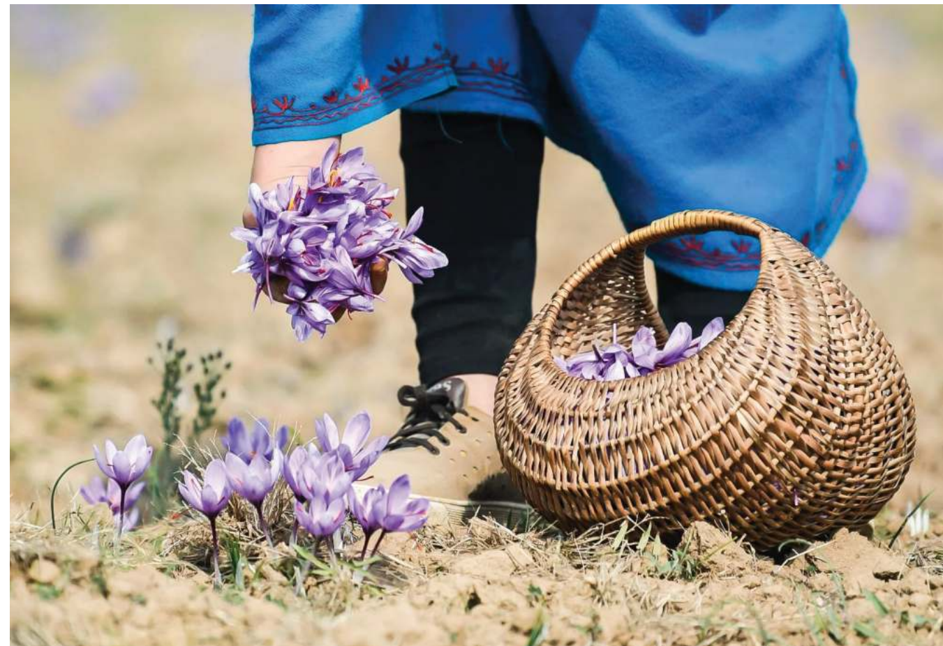
Saffron Blooms In Kashmir.

On October 24, two soldiers and two Army porters were killed while another porter and a soldier were injured in a militant attack on | More on P6