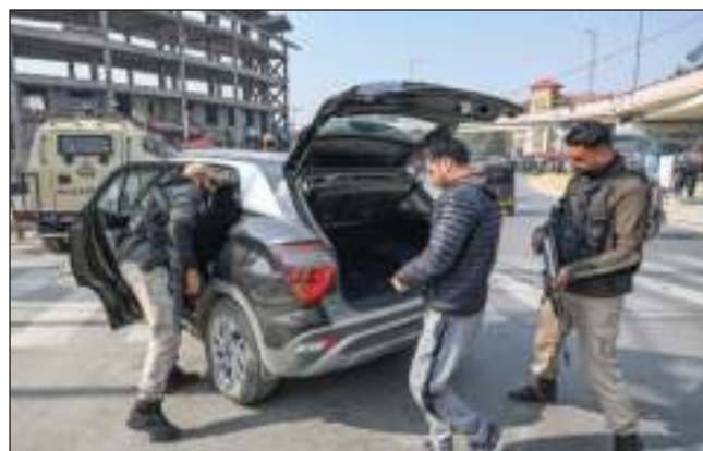
Intensified security checks underway amid heightened terror threats in Jammu & Kashmir.

Defence spokesman in Srinagar in a statement said that Pakistani terrorists, with