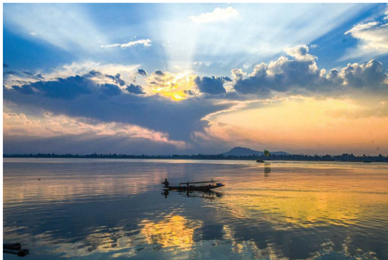
A breathtaking sunset paints the sky above Dal Lake, casting a warm glow on the water and the shikara boat.

Political parties in Jammu and Kashmir on Friday described the reported resolution by Chief Minister Omar Abdullah-led cabinet seeking restoration of statehood only and not Article 370 as an "utter surrender" and a departure from the stand of the ruling National Conference (NC). While there has been no word from either the government or the NC, a Jammu-based newspaper 'Daily Excelsior' carried a report that the | More on P6