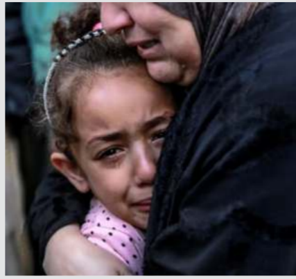
warned Wednesday of the risk of famine in the territory, where vast areas have been devastated by Israel's retaliatory as-

The head of the UN agency for Palestinian refugees, Philippe Lazzarini, also