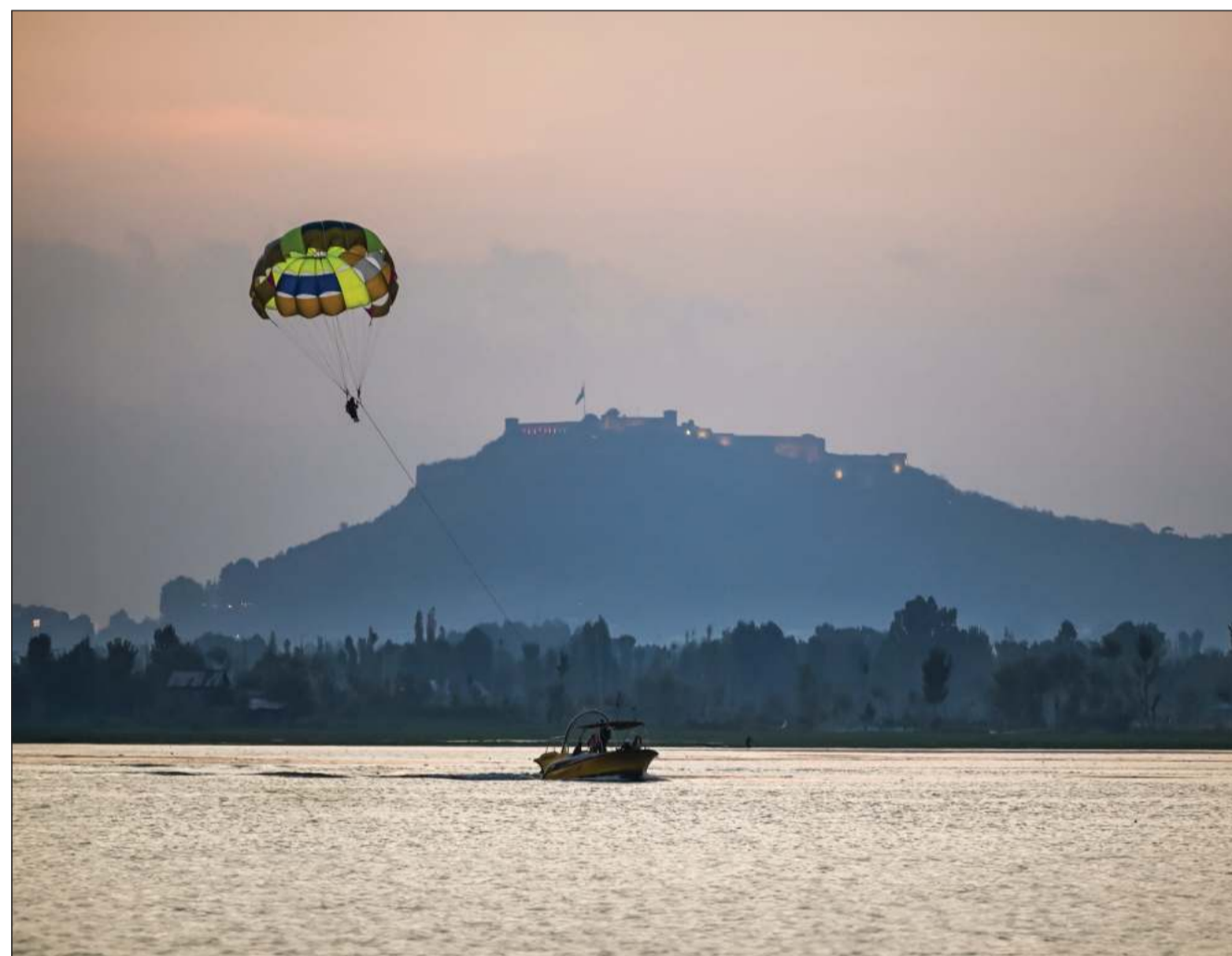
Tourists parasailing over Dal Lake, Srinagar, with the majestic Hari Parbat Fort in the background.

MY MESSAGE IS THAT NOW THAT THE PEOPLE HAVE GIVEN THE MANDATE, the elected representatives should fulfill their promises to the people of J&K."