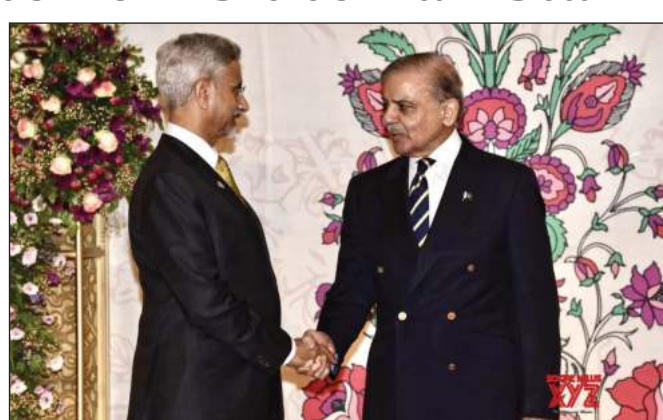
nine years that India's foreign minister travelled to Islamabad,