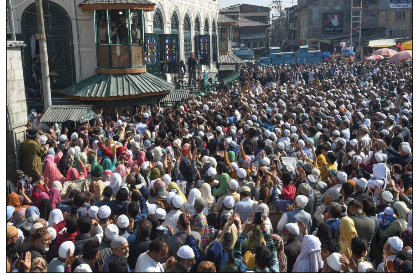
Devotees gather at Shrine of Sheikh Syed Abdul Qadir Jeelani (RA) to have a glimpse of the holy relic.