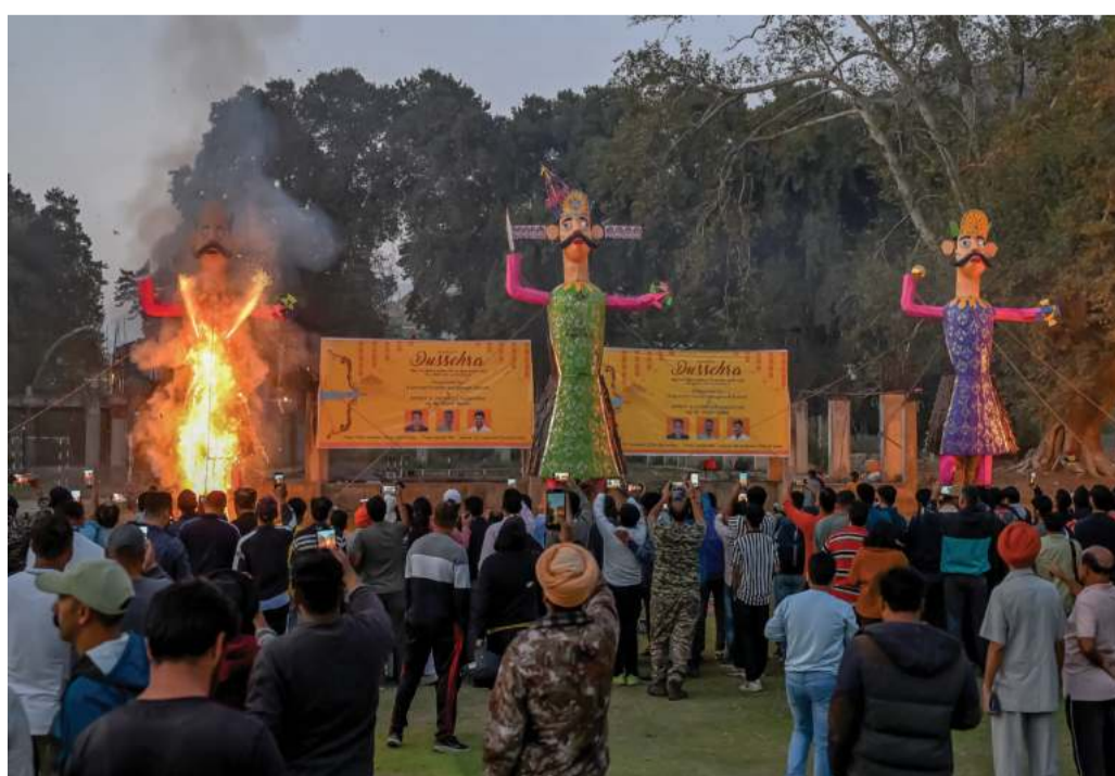
Devotees burn Ravana effigies on the eve of Dussehra In Srinagar.

The hospital administration's failure to | More on P6