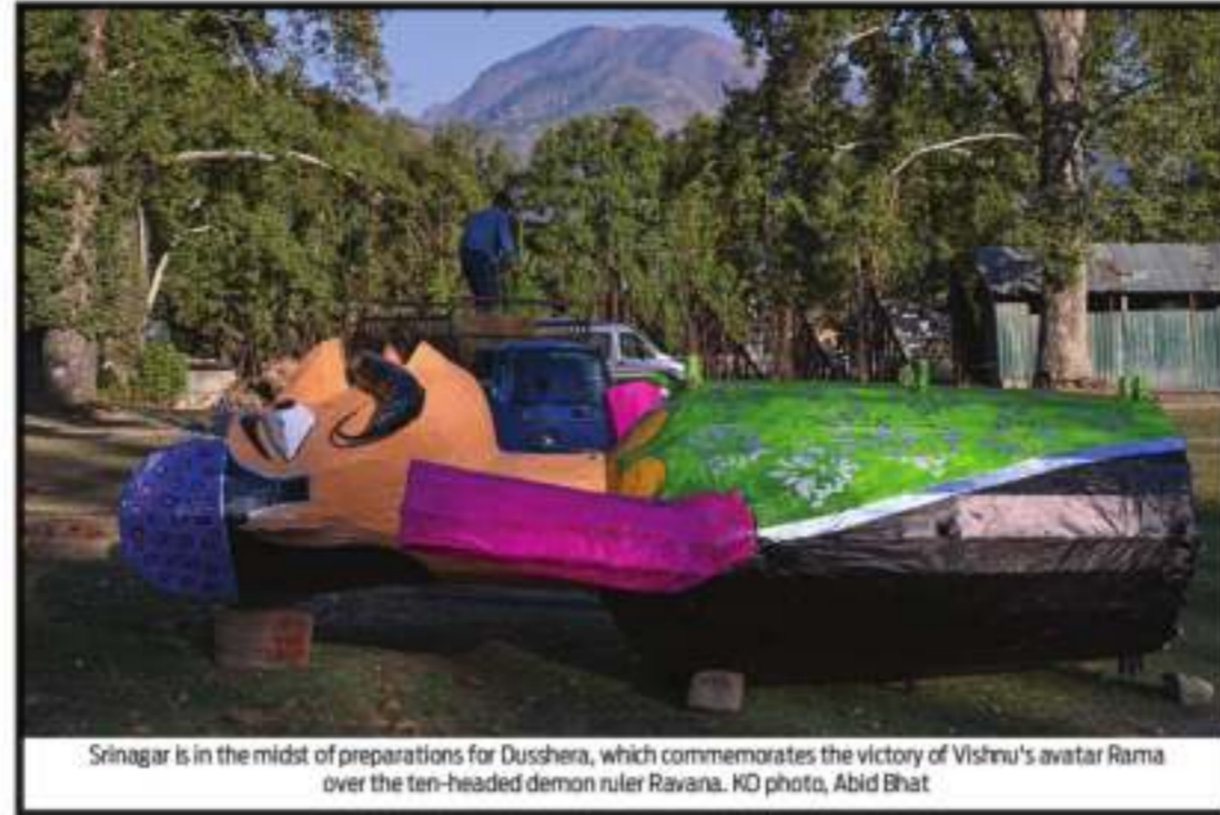
Srinagar is in the midst of preparations for Dusshera, which commemorates the victory of Vishnu's avatar Rama over the ten-headed demon ruler Ravana.

"We have raised the issue multiple times, but no one is listening," lamented the locals. [KNT]