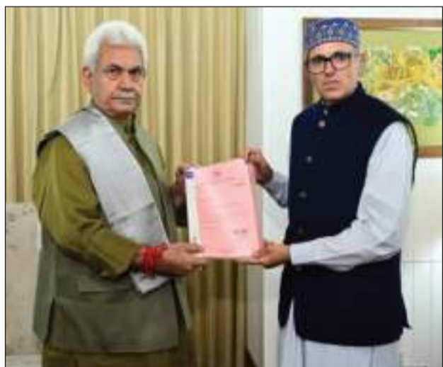
His first term, from 2009 to 2014 when Jammu and Kashmir was a full-fledged state, was also under an NC-Congress coalition government. The NC won | More on P6

Omar was unanimously elected the leader of the NC Legislature Party on Thursday, setting the stage for his second term as chief minister.