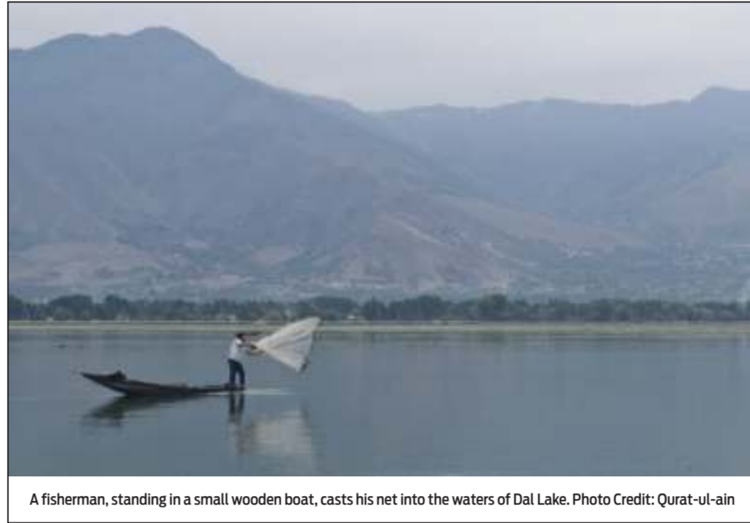
A fisherman, standing in a small wooden boat, casts his net into the waters of Dal Lake.

Residents have urged the district administration to intervene and address these critical issues. "We request the authorities to take immediate action to alleviate our daily hardships and improve living conditions in our village," they said