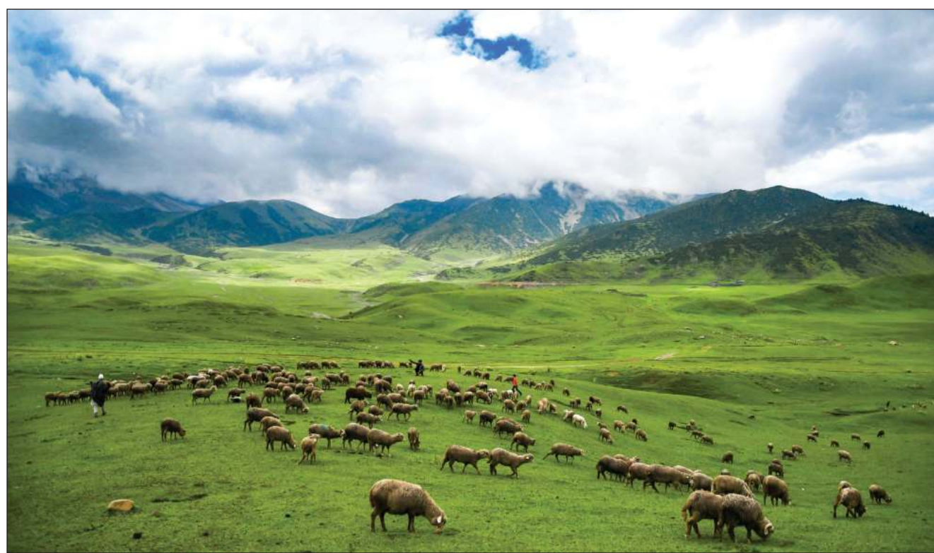
SHEEP GRAZING IN THE SCENIC meadows of Tosa Maidan.