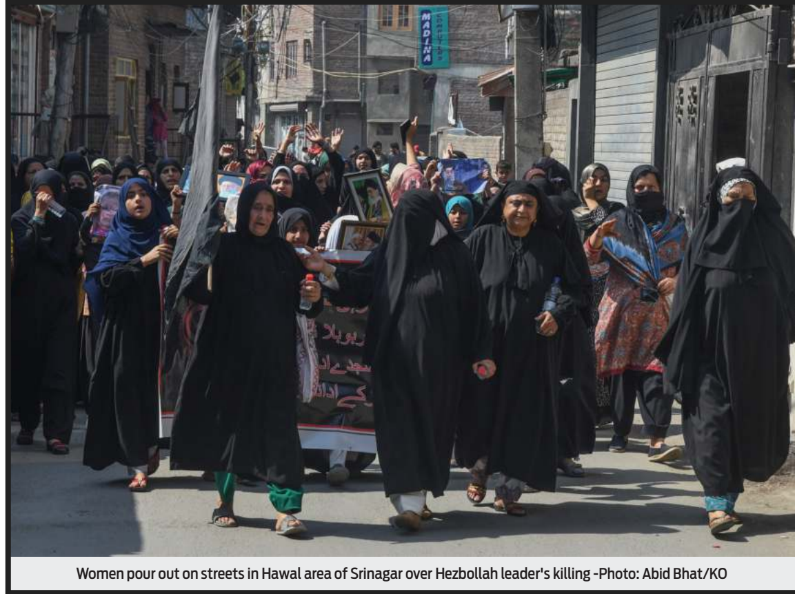
Women pour out on streets in Hawal area of Srinagar over Hezbollah leader's killing

This is the first Assembly election in Jammu and Kashmir since the abrogation of Article 370 of the Constitution in August 2019, with the results set to be announced on October 8.