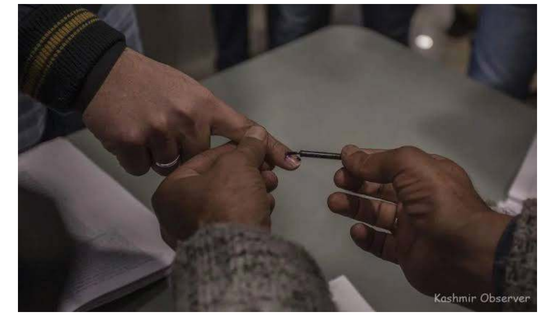
• It was assumed that people would exercise their franchise in large numbers in areas which had boycotted elections in the past; areas such as Srinagar. However, the voting percentage has not risen as was expected

People in Srinagar see voting in elections and standing in queues outside polling stations as an act of abjectness and dishonour. The reason is a narrative that popped up in the last 35 years against mainstream politics in J&K. Even as there were no boycott calls, no militant threats, protests and stone pelting in Srinagar's downtown, people voluntarily didn't go out to vote. In Habbakadal, the voter turnout has come