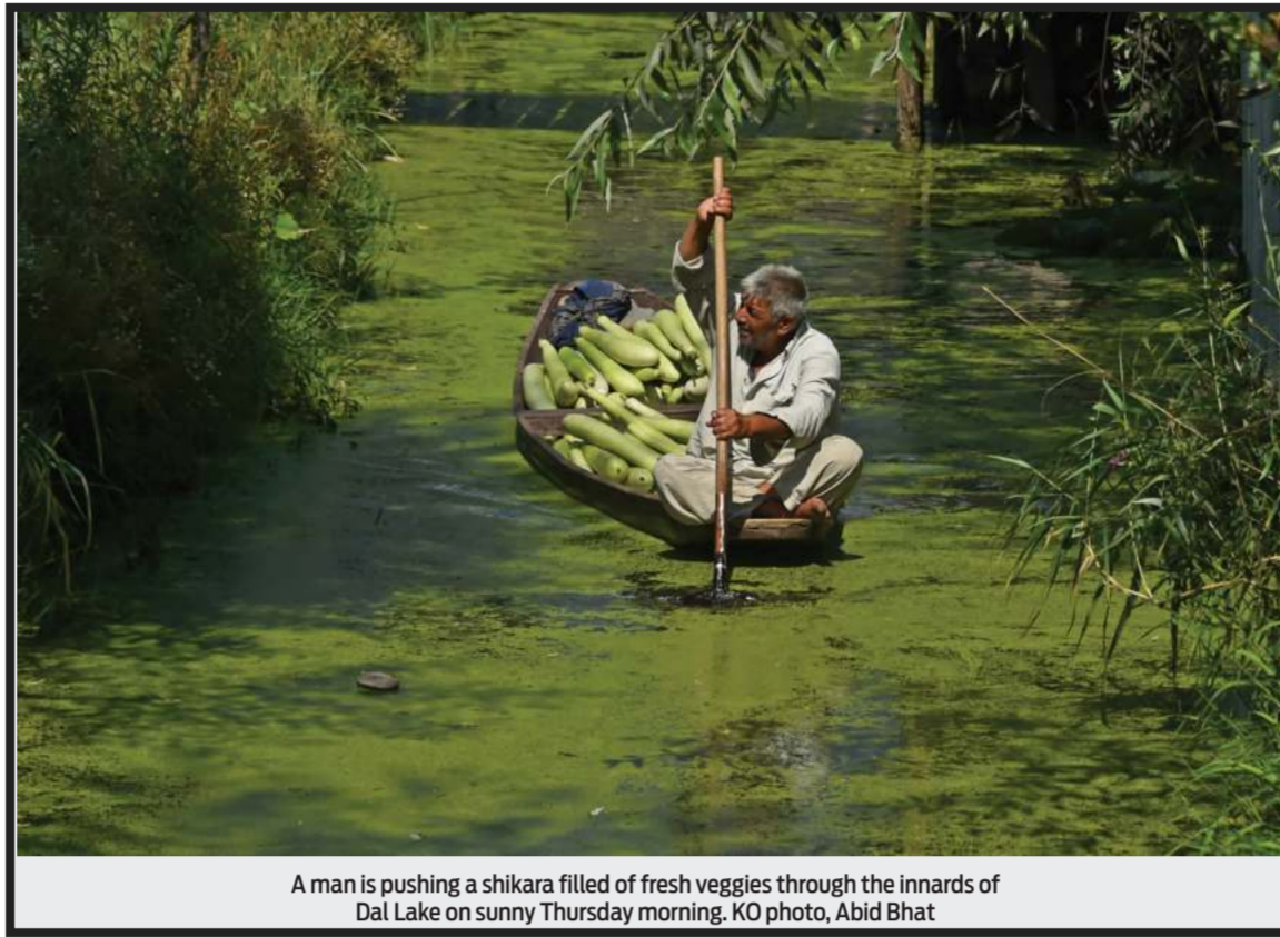
A man is pushing a shikara filled of fresh veggies through the innards of Dal Lake on sunny Thursday morning