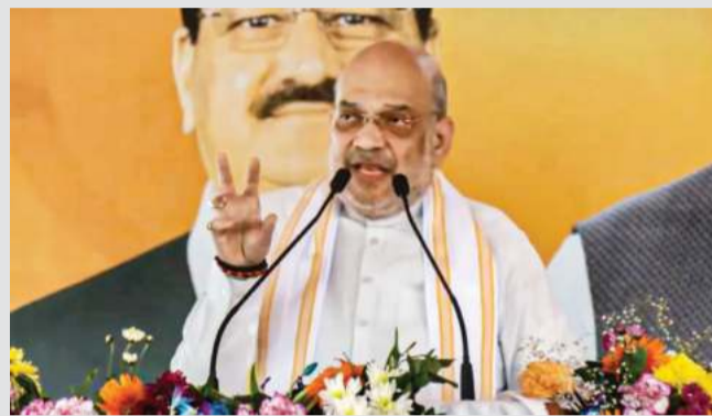
senior Bharatiya Janata Party (BJP) leader said, addressing a poll rally in this Assembly segment in Jammu and Kashmir's Kathua district. This was Shah's fourth rally of the day in Udhampur and Kathua districts. | More on P6

"For vote-bank politics, they (opposition parties) are asking for talks with terrorists. If they want to talk, let them come forward after giving up arms. In the northeast, 10,000 people have surrendered," the