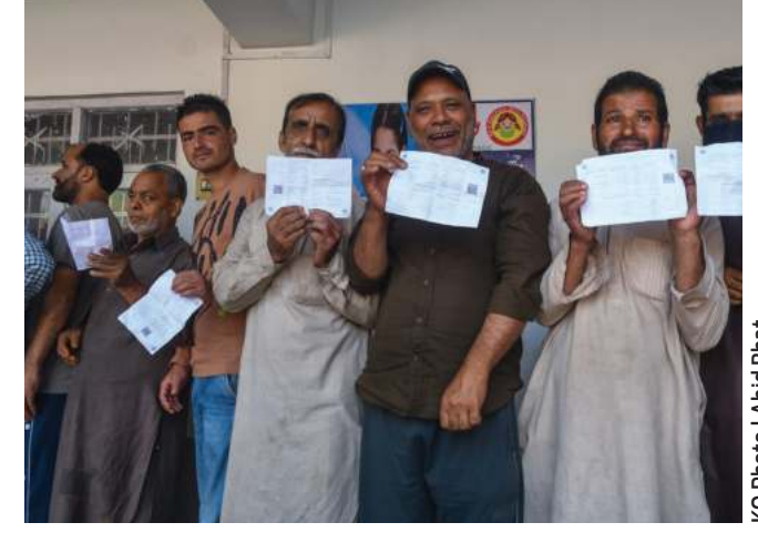
Observer News Service

Srinagar: More than 56 per cent voters on Wednesday exercised their franchise in the second phase of polling for 26 seats in Jammu and Kashmir assembly