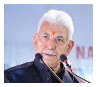
Observer News Service

Srinagar: The Lieutenant Governor Manoj Snha has extended hearty congratulations to the voters of the second phase of Assembly Election for turning out in large numbers to exercise their franchise. In a social media post, the Lieutenant Governor applauded the spirit of the people to strengthen the democratic values and for upholding the rich democratic traditions.