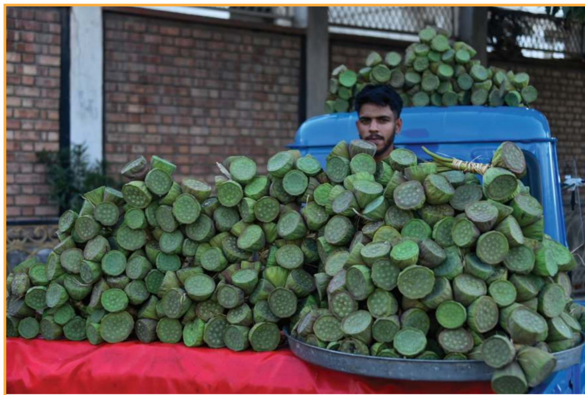
As autumn season begins, vendors begin to offer fresh lotus seeds, also known as 'Pambach', which is consumed raw due to its rich, sweet taste.

He said that countless youths were killed, blinded by pellets, and imprisoned when the traditional parties were in power. "No one came from Delhi to register FIRs against these young people. Now, the situation is such that many of these