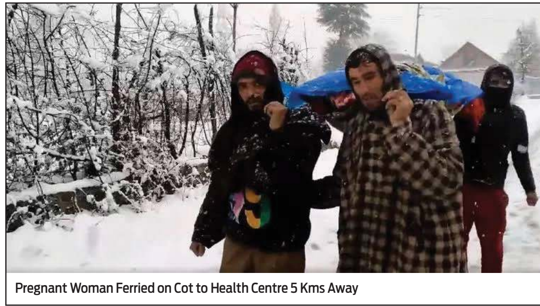
Pregnant Woman Ferried on Cot to Health Centre 5 Kms Away

Crumbling infrastructure, extreme weather conditions, and ongoing conflict in Kashmir contribute much to the hostility of the region's healthcare challenge. According to a few reports by NFHS-5, 50% of the women in Jammu and Kashmir suffer from anaemia — a condition preventable but kept in perpetual neglect. About 30% live below the poverty line,