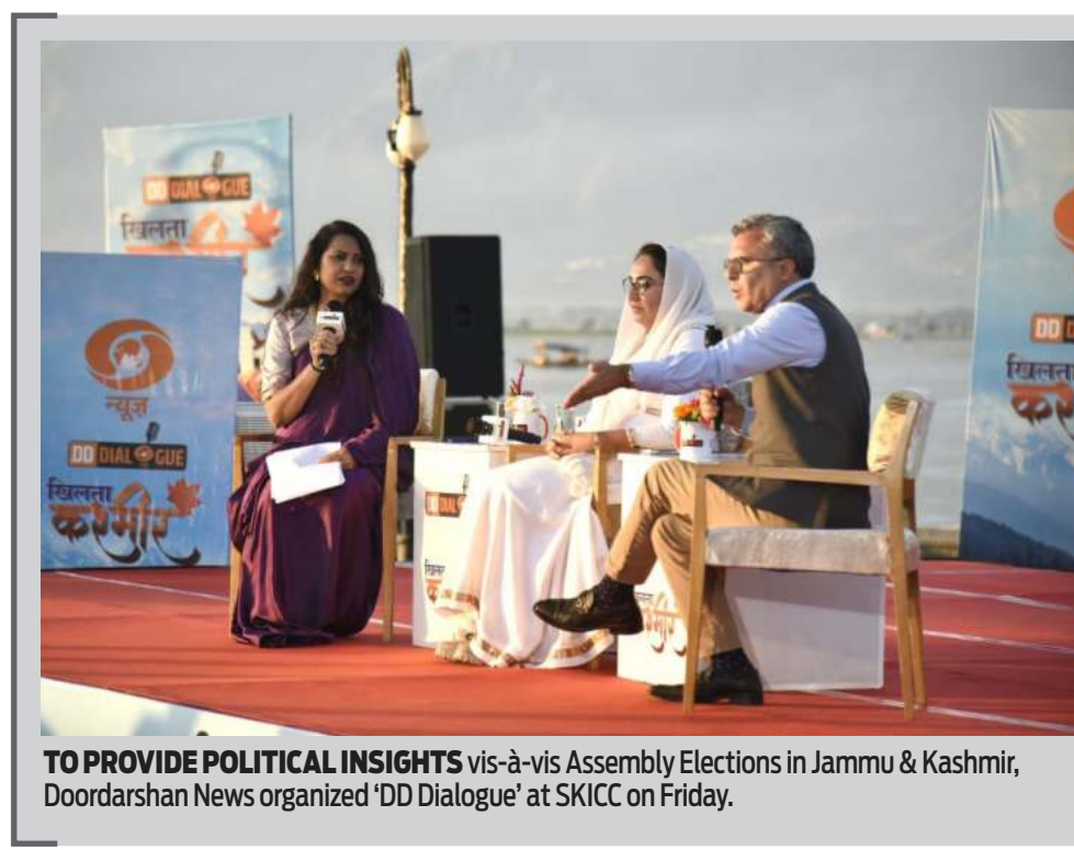
TO PROVIDE POLITICAL INSIGHTS vis-à-vis Assembly Elections in Jammu & Kashmir, Doordarshan News organized 'DD Dialogue' at SKICC on Friday.

ding and class leading dynamics. It effortlessly blends Thar's outdoor DNA with modern sophistication, offering a premium SUV experience that caters to those who demand the finest in every aspect of their lives. The Thar ROXX has been rigorously tested in extreme conditions across diverse terrains and altitudes, including the scorching sand dunes of the Thar desert at +50°C, the high altitudes of Umping La, tricky muddy surfaces in Coorg and the freezing cold of -20°C in Kaza. This extensive testing guarantees that the Thar ROXX is a robust and reliable choice for the Global Indian - people who are Indian at heart but have a global mindset.