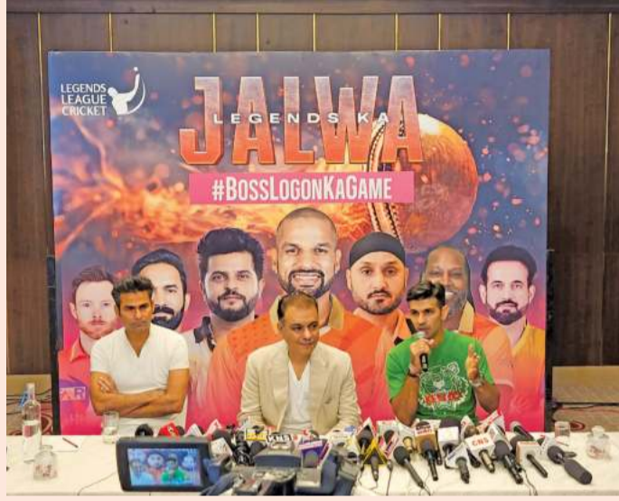
Cricket are extremely excited to be coming to Kashmir this season," Kaif said. "It will be extremely special to play at this

wonderful stadium and in front of our wonderful fans that are yet to watch us play live. I look forward to a packed stadium and we will do our best to put on a show for the people of Kashmir."