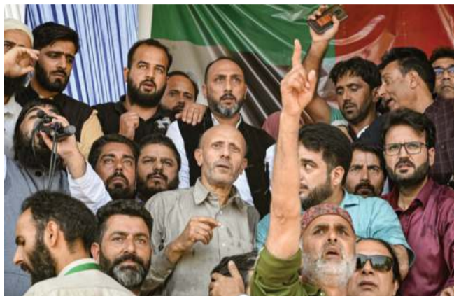
Known for his outspoken demeanor, the AIP leader went down on his knees and touched his forehead on the road after exiting the airport. "Alhamdulillah, | More on P6

Rashid, who served five and a half years in Tihar Jail in connection with a terror funding case was released on interim bail from Tihar Jail on Wednesday for around three weeks. He arrived in Srinagar this morning to a grand welcome from hundreds of his supporters.