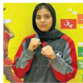
national games if she secures a top-eight finish at the championship. She is a Khelo India National bronze medalist, All India University Silver Medalist and a three-time state champion.