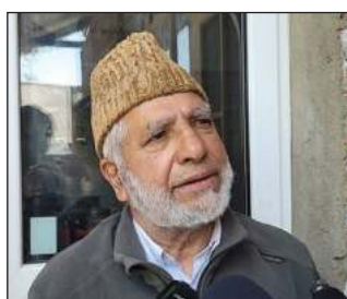
years in February 2024. Jama'at-e-Islami has not taken part in any elections since 1987.

The organisation cannot take part in the elections due to the ban imposed on it by the Union Home Ministry. The outfit was first declared an 'Unlawful Association' in 2019, which was then extended for five more