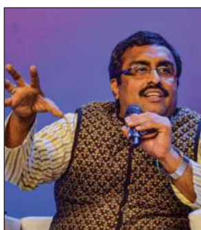
PDP since he was the chief architect of the PDP-BJP coalition government in 2015. "Ram Madhav was responsible for bringing the PDP and the BJP on one platform. He brokered the alliance.

The NC leader Omar Abdullah has suggested that Ram Madhav may have been sent to revive alliance with the