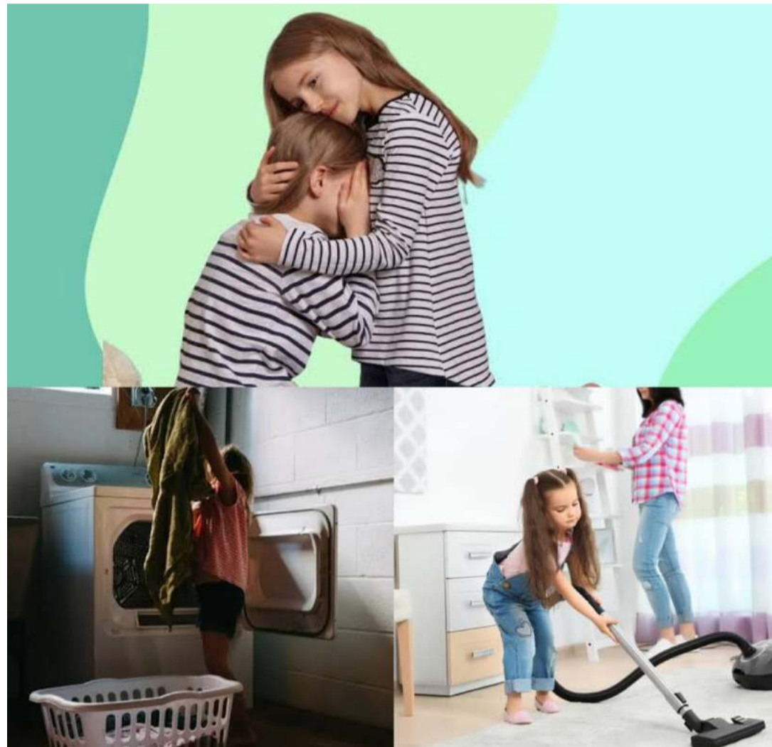
trolling the mood at home.