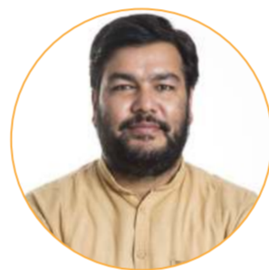
Dr Raja Muzaffar Bhat

"All the Industrial Estates are being provided with all infrastructural facilities like Road network, water supply, internal Power distribution, drainage system besides CETP, Common facility Centre, which houses Conference Hall, Bank Counter, Dispensary, ATM, Cafeteria etc. SICOP also estab-