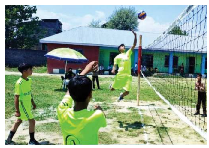
Observer News Service

BUDGAM: On the eve of National Sports Day, the Department of Youth Services and Sports Budgam organised a series of sports activities on Saturday as part of the ongoing week-long sports and awareness programs across all 12 zones of the district.