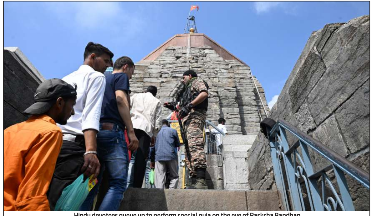
Hindu devotees queue up to perform special puja on the eve of Rasksha Bandhan at the Shankar Acharya temple in Srinagar on Monday.