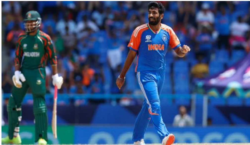
Cricket Stadium - and the first since the historic India-South Africa ODI in 2010, where the

The match in Gwalior marks the inaugural international fixture at the city's new stadium - Shrimant Madhavrao Scindia