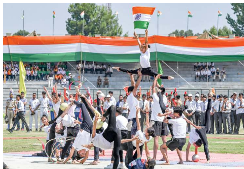
INDEPENDENCE DAY 2024: Full Dress Rehearsals Held At Bakshi Stadium, Srinagar.

The process for appointments to revive the body was shelved by the J & K government earlier this year. "It is hereby notified for information of the general public and all concerned that the advertisement notice issued under endorsement No. SWD-ICPS/55/2021, dated 15.6.2023 More on P10