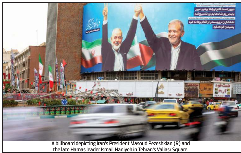
A billboard depicting Iran's President Masoud Pezeshkian (R) and the late Hamas leader Ismail Haniyeh in Tehran's Vallasr Square.

But the army rarely comments on individual strikes, which often kill women and children. Gaza's Health Ministry says nearly 40,000 Palestinians have been killed since the start of the war, without saying how many were fighters.