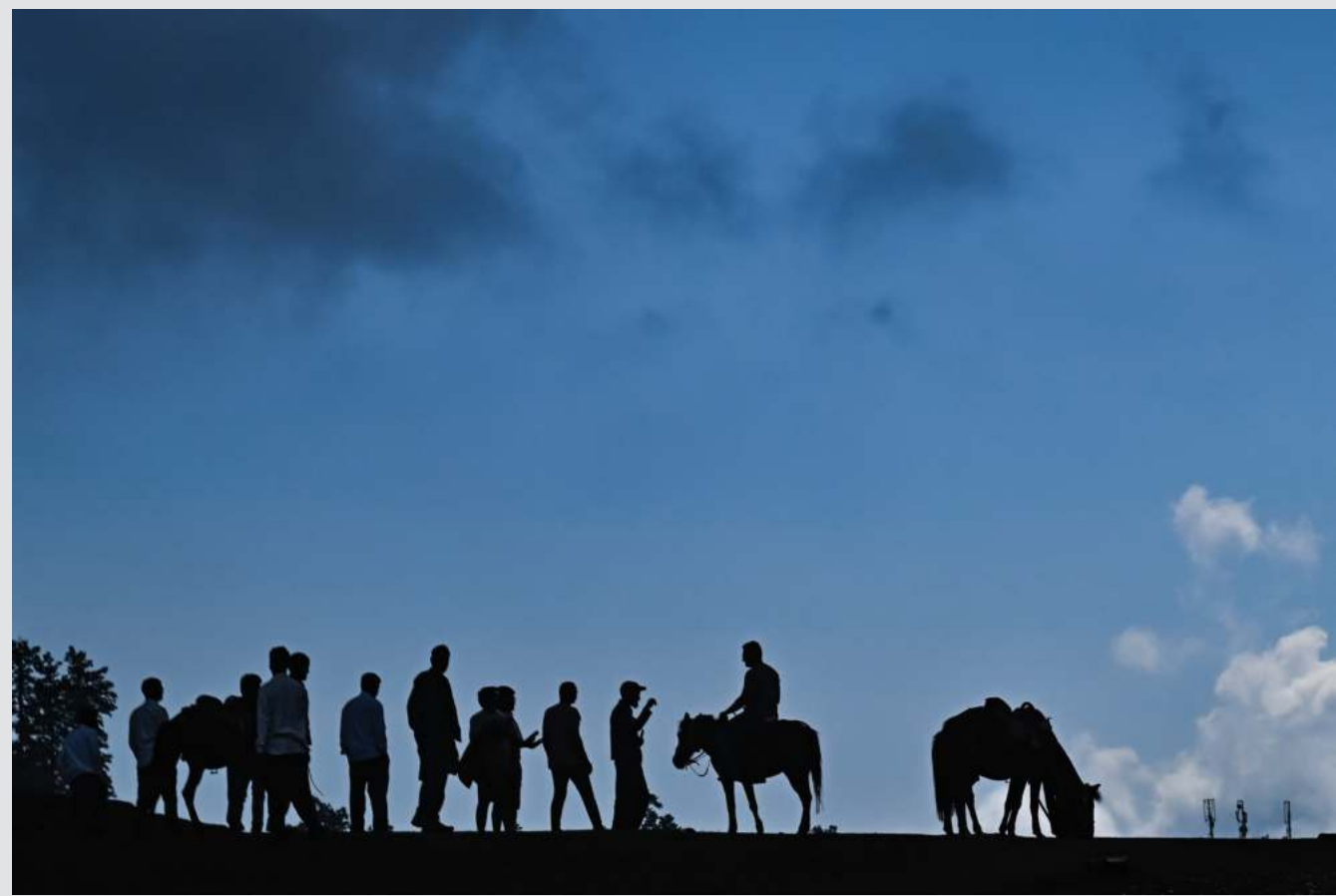
Silhouettes of people and horses set against the evening sky at Gulmarg.

joint search parties comprising Army troopers, including para commandos, and local police. In the ensuing gun battle, six Army personnel and two civilians were injured, officials said, adding the injured soldiers were promptly taken to a nearby hospital where two died shortly after arrival. The remaining injured personnel and civilians are receiving medical attention, they said. Reinforcements have been deployed in the area and operations to locate and neutralise the fleeing terrorists are underway, the officials said. This encounter is a grim reminder of a similar operation in the general area of Kokernag last September, during which four security personnel, including Colonel | More on P10