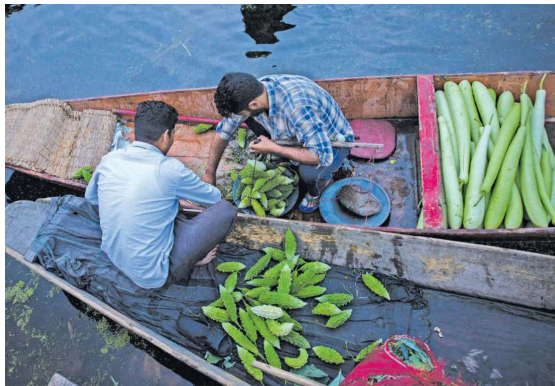
A VEGETABLE VENDOR weighs fresh produce for customers at the well-known Sabzi Mandi in Srinagar's Dal Lake on a sunny Saturday morning.