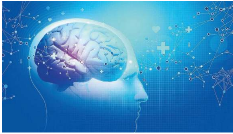
social. Autism is a neurodevelopmental disorder in which one

Intellectual disabilities refer to a set of neurodevelopmental conditions that affect one's functioning in two aspects - cognitive (thinking) processes, including learning and problem solving, and adaptive processes involving daily activities such as communication and being