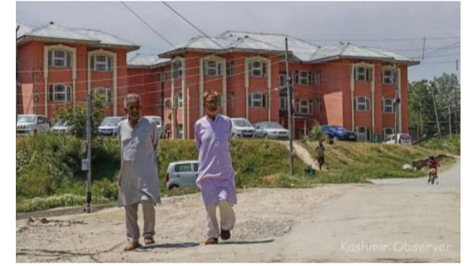
File photo of Pandit Colony in Sheikhpora Budgam

MHA Says Various Measures Taken For Their Security, Employment