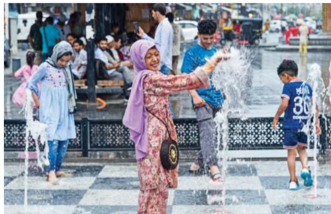
KO Photo | Abid Bhat