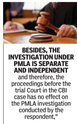
BESIDES, THE INVESTIGATION UNDER PMLA IS SEPARATE AND INDEPENDENT and therefore, the proceedings before the trial Court in the CBI case has no effect on the PMLA investigation conducted by the respondent."

The Jammu and Kashmir Service Selection Board (JKSSB)