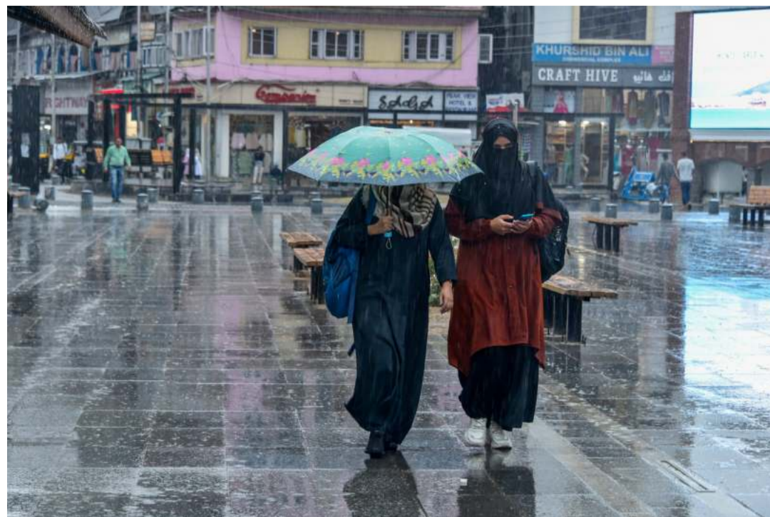
AFTER DAYS OF INTENSE HEAT WAVE, Srinagar received much-needed rainfall on Monday.

Ld. Advocates/litigants who are interested to settle their dispute in the said Lok Adalat are directed to approach the concerned courts immediately so that their cases shall be listed for amicable settlement in the Lok Adalat.