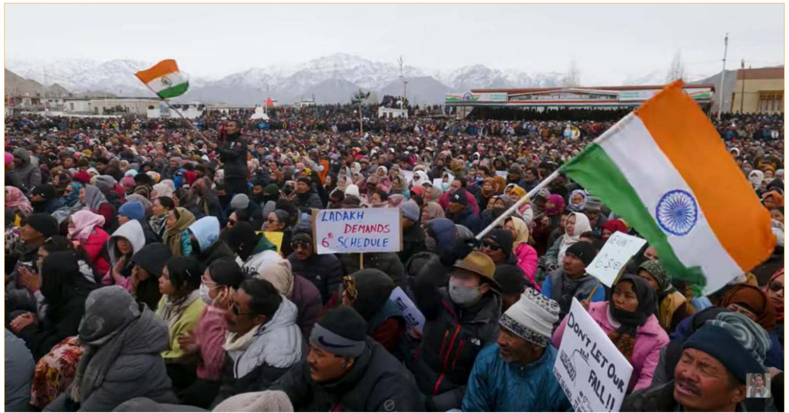
Protests in Ladakh's Leh to demand Sixth Schedule for the region. 3-02-2024

While the immediate focus is on dealing with the imminent heatwave, it is also essential to recognize the broader implications of such extreme weather events in the context of climate change. The increasing frequency and intensity of heatwaves are a stark reminder of the urgent need to take decisive global action to mitigate the effects of climate change. We also need to recognize its impact on the vulnerable regions like Kashmir. But it may take decades before the world is able to sufficiently reign in the factors which are contributing to the disruption in the climate. As continuing heatwaves show, the world needs to quickly get its act together before it is too late. And at a smaller level in our region, the authorities have to take steps to ensure that our fragile environment is protected from the increasing human encroachment.