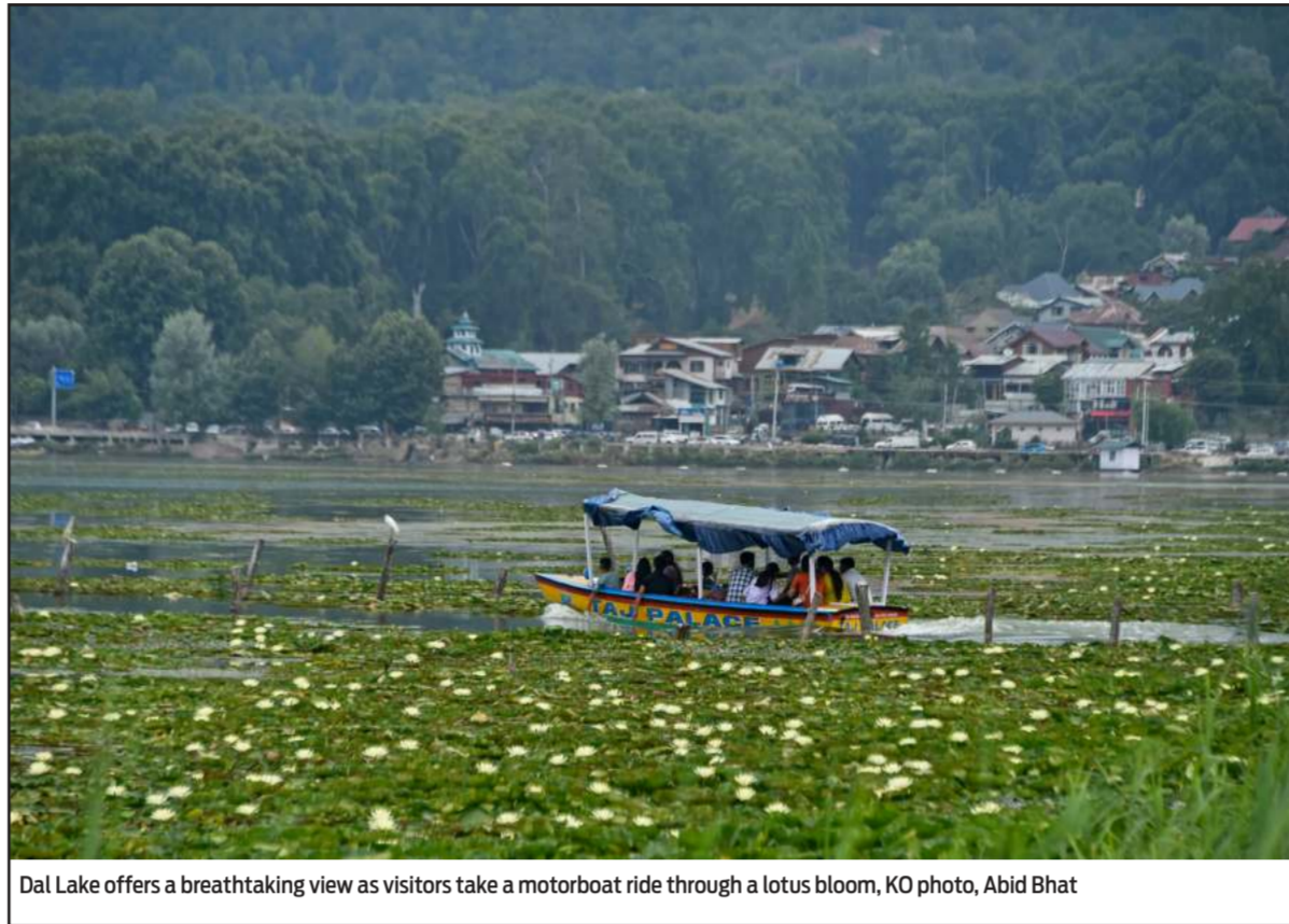
Dal Lake offers a breathtaking view as visitors take a motorboat ride through a lotus bloom

The DEO also instructed all the EROs/AEROs to create momentum regarding the exercise from the day first and supervise the process with focused attention to ensure 100% registration of all eligible electorates and ensure no elector is left unregistered.