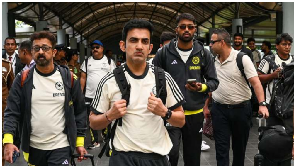
The Suryakumar-led side will play the first of the three T20Is on July 27, followed by matches on July 28 and 30.

India will play a three-match T20I series against the home side.