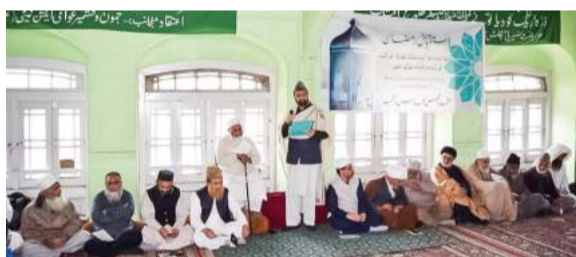
File Photo Ali Hamadani in Srinagar. MMU, which is led by Mirwaiz Umar Farooq,

Srinagar: Muttahida Majlis-e-Ulama (MMU), a conglomerate of major religious bodies of Jammu & Kashmir on Saturday called for maintaining peace and sectarian harmony following a controversy over a mourning ritual during Muharram by some members of the Shia community inside Khanqah of Mir Syed