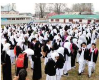
17 percent, resulting in a total enrolment of around 14.18 Lakhs."

The official said, "In the year 2022-23, AAO School Chalein Campaign, was launched and there was a notable increase of