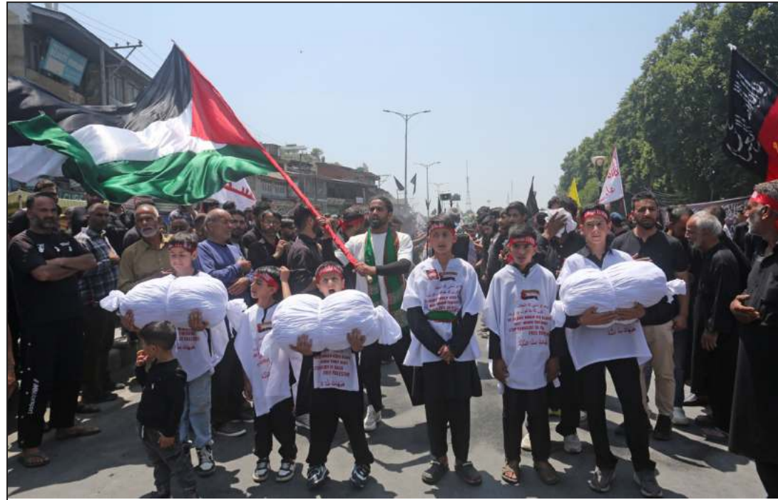
Solidarity with the children of Gaza: 8th Muharram procession in Srinagar Monday displayed wider support for the Palestinian people.

The tribunal had directed this team to suggest remedial measures including setting up of waste processing facilities to zero down landfill and submit the report before the Tribunal within eight weeks.