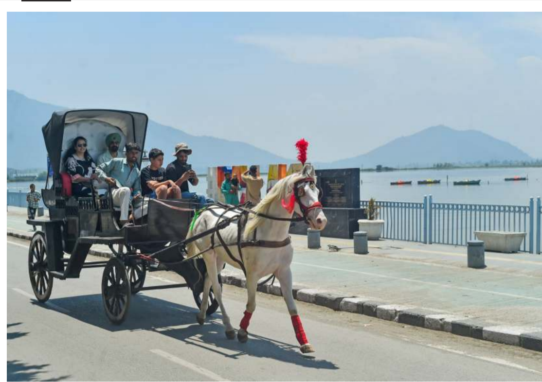
TOURISTS AND LOCALS ALIKE take pleasure in the Royal Horse Cart on trendy Boulevard Road, an endeavor to revive ancient means of transportation in Kashmir.

Pertinently, boats were a popular mode of transport in Kashmir until the 1970s.