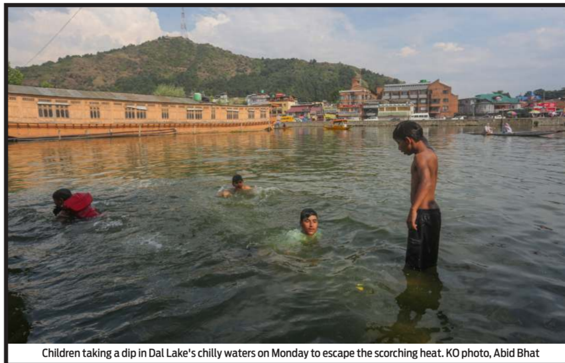
Children taking a dip in Dal Lake's chilly waters on Monday to escape the scorching heat.

Notably, several netizens raised alarms about road safety, prompting swift action from the traffic authorities.