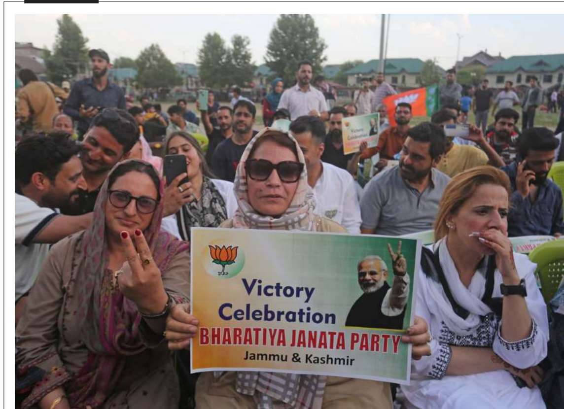
FESTIVITIES MARKING THE BJP-LED NATIONAL DEMOCRATIC ALLIANCE (NDA) victory in the Lok Sabha-2024 elections at the party's Srinagar head office on Tuesday.

Doctors said there is no cure for mumps and that the treatment focuses on supportive care including pain control, bed rest, fluids and fever reduction.