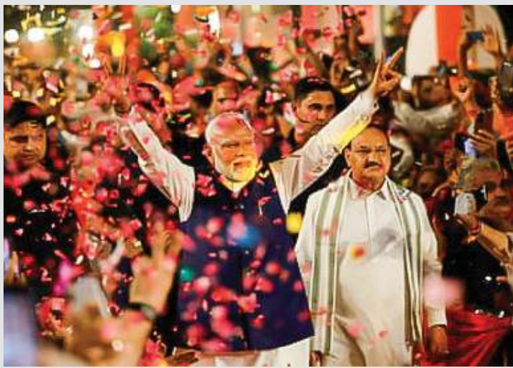
Press Trust Of India

New Delhi: Prime Minister Narendra Modi was on Tuesday poised to form the government for a third consecutive term notwithstanding crushing losses in three Hindi heartland states after a bitterly fought election that was projected as a referendum on his popularity. The Bharatiya Janata Party, whose candidates had contested in the name of Modi, won or was