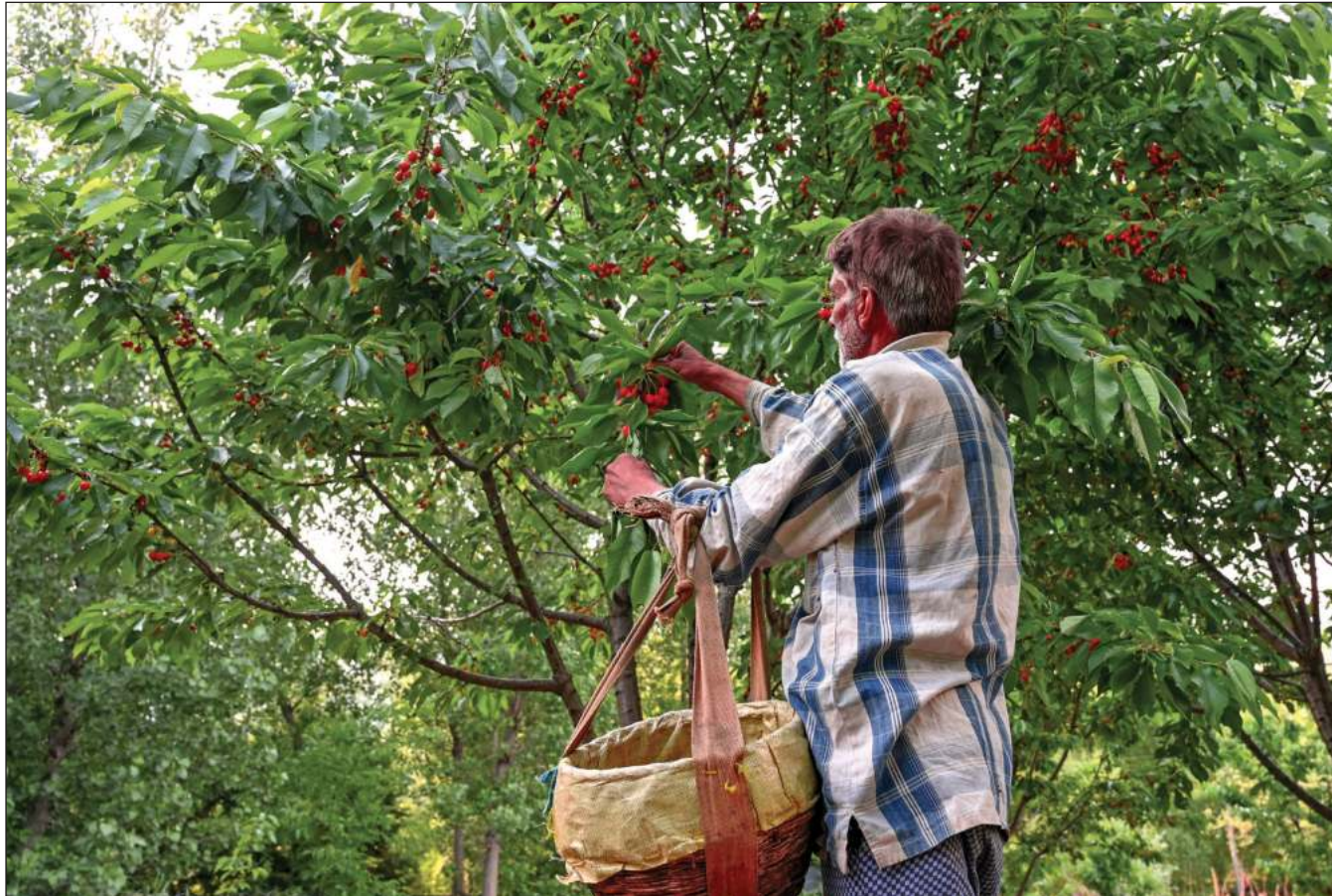
A farmer meticulously harvests ripe cherries on the outskirts of Srinagar.

He further stated that the weather would remain generally dry on June 03 and June 04, adding that generally cloudy with possibility of intermittent light to moderate rain and thunder is expected at many places with gusty winds at few places from June 05-07 | More on P6