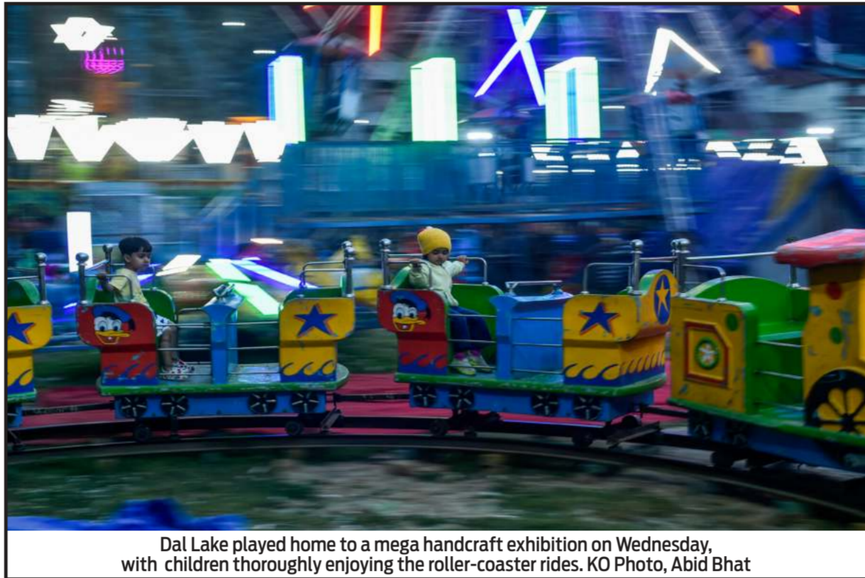
Dal Lake played home to a mega handcraft exhibition on Wednesday, with children thoroughly enjoying the roller-coaster rides.

This initiative not only highlighted the importance of addressing desertification but also encouraged young minds to think critically about sustainable solutions. By engaging the youth in such meaningful activities, DEERS-EIACP Hub Jammu & Kashmir aims to foster a deeper understanding of ecological issues and inspire collective action towards a sustainable future.