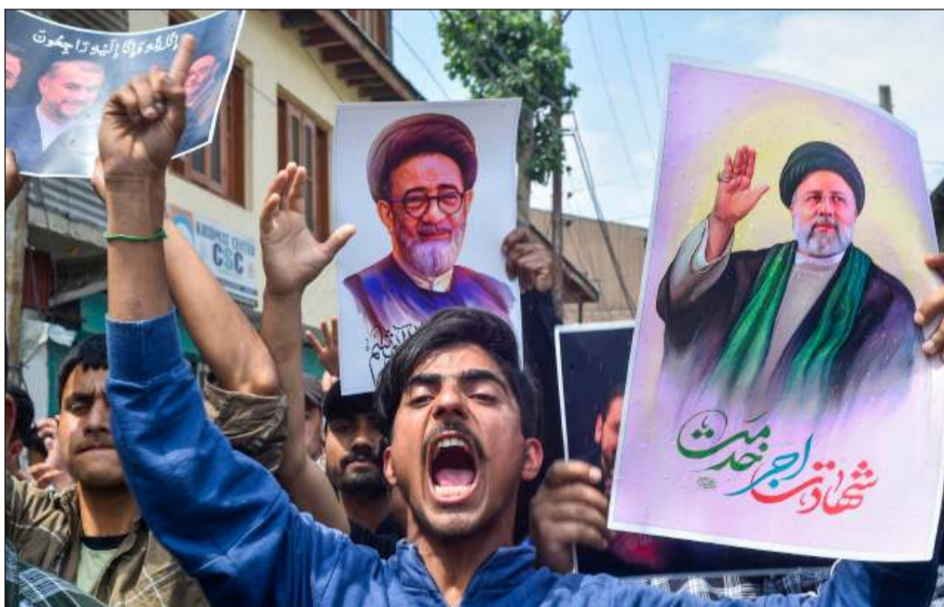
PRESIDENT EBRAHIM RAISI'S DEATH: Mourners in Srinagar took to streets on Friday to express condolences with the Iranian nation.

"It may not be out of sync to point out that with a view to rehabilitating ex-militants/surrendered militants, the Government of Jammu and Kashmir has been promulgating rehabilitation policies. I am reminded of issuance of Government Order No.Home-1376(IAS) of 2010 dated 23.11.2010 laying down the policy and procedure for return of ex-militants to Jammu and Kashmir State," the court said, adding, "As the | More on P6